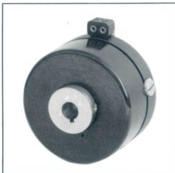
Cat No 24034 Type FS 80/1L Long Hub

Type FS/1 Brakes may be used in both dynamic braking and holding applications. The constructional principles are shown in this diagram.