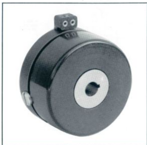
Cat No 24033 Type FS 80/1S Standard Hub

CLARK ELECTRIC CLUTCH TYPE FS/1 FAIL SAFE BRAKES are multi-spring operated electromagnetically released. They are engineered to a very high standard for incorporation into the highest quality machines. They feature a provision for checking and adjusting for wear without dismantling.